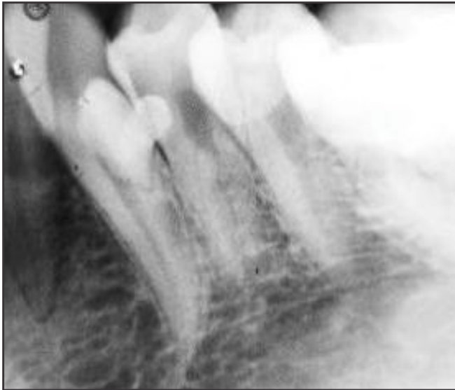
Figure 2: Intraoral periapical radiograph showing radiopaque tooth like single structure with radiolucent halo inside the opacity

An intraoral periapical radiograph was advised to determine the extent and relation of the supernumerary tooth to surrounding structures. It showed a single radiopaque tooth like structure present in relation to 33 and 34, with well defined smooth periphery (Figure-2).