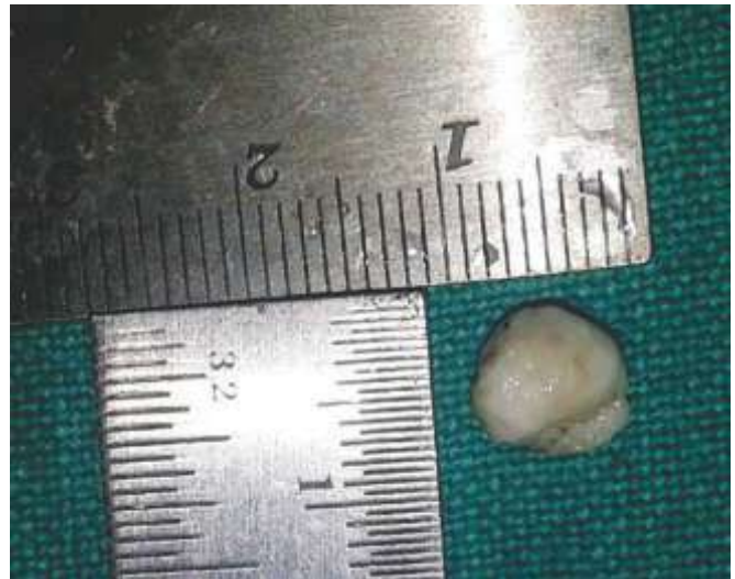
Figure 3: An extracted specimen of erupted compound odontoma consisting of tooth like structure with no evidence of root structure.

The tooth-like structure was surgically removed under local anesthesia. Gross examination of the specimen showed tooth like structure with no evidence of root structure (Figure-3).