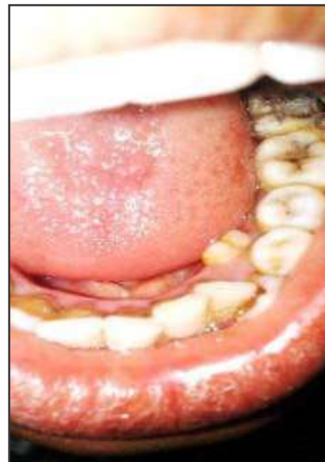
Figure 1: Clinical photograph showing erupted compound odontoma clinically seen as supernumerary teeth lingual to lower left premolar

On intraoral examination, an extra tooth-like structure resembling a premolar was present lingual to 34 (Figure-1).