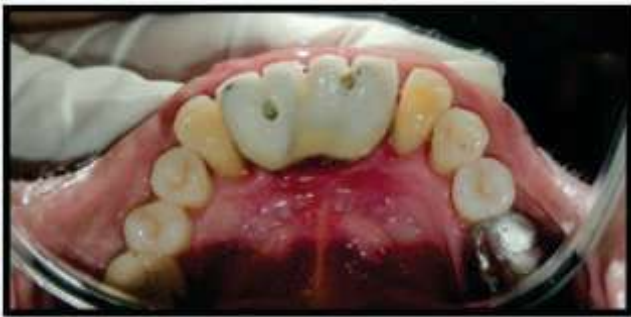
Fig. 1 PRE-OPERATIVE CLINICAL

At the end of the prescribed treatment the patient presented with significant reduction of inflammatory signs (reduction of probing depth, bleeding on probing, suppuration and tissue retraction). The reduction in radiographic signs were also seen (figure 3 and figure 4).