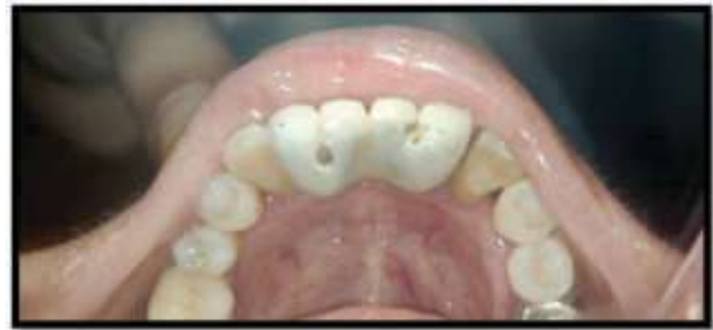
Fig. 3 POST-OPERATIVE CLINICAL