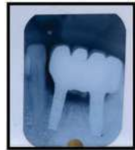
Fig. 4 POST-OPERATIVE RADIOGRAPHIC