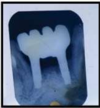
Fig. 2 OPERATIVE RADIOGRAPHIC